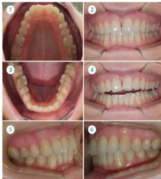
1 Upper jaw occlusal view